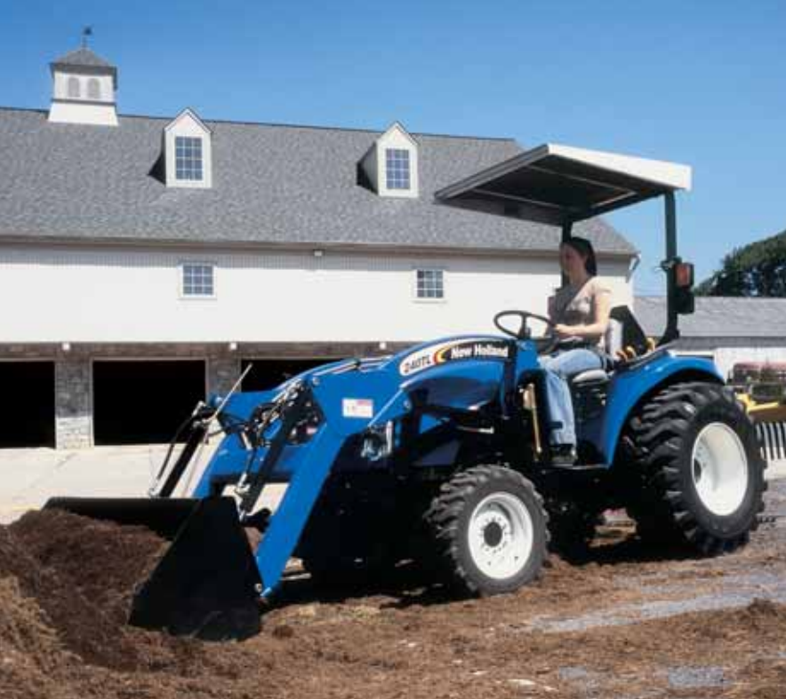
The 200TL Series loaders provide unmatched visibility to the bucket.